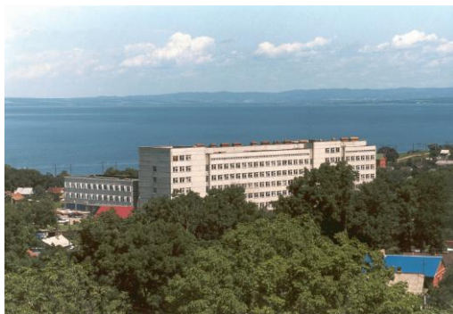
POI main building, Vladivostok, Russia

V.I. Il'yichev Pacific Oceanological Institute, Far Eastern Branch, Russian Academy of Sciences, Vladivostok, Russia